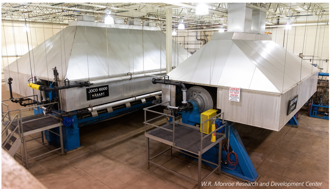
W.R. Monroe Research and Development Center